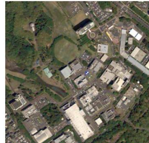
Simulated image JAXA Tsukuba Space Center

ALOS-2 sample data available from http://en.alos-pasco.com/sample/ .